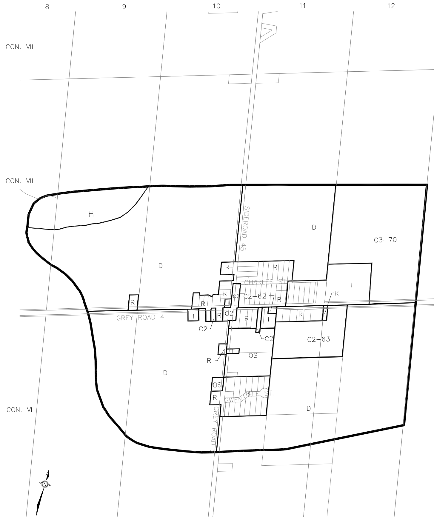
MAP A: HAMLET OF MAXWELL