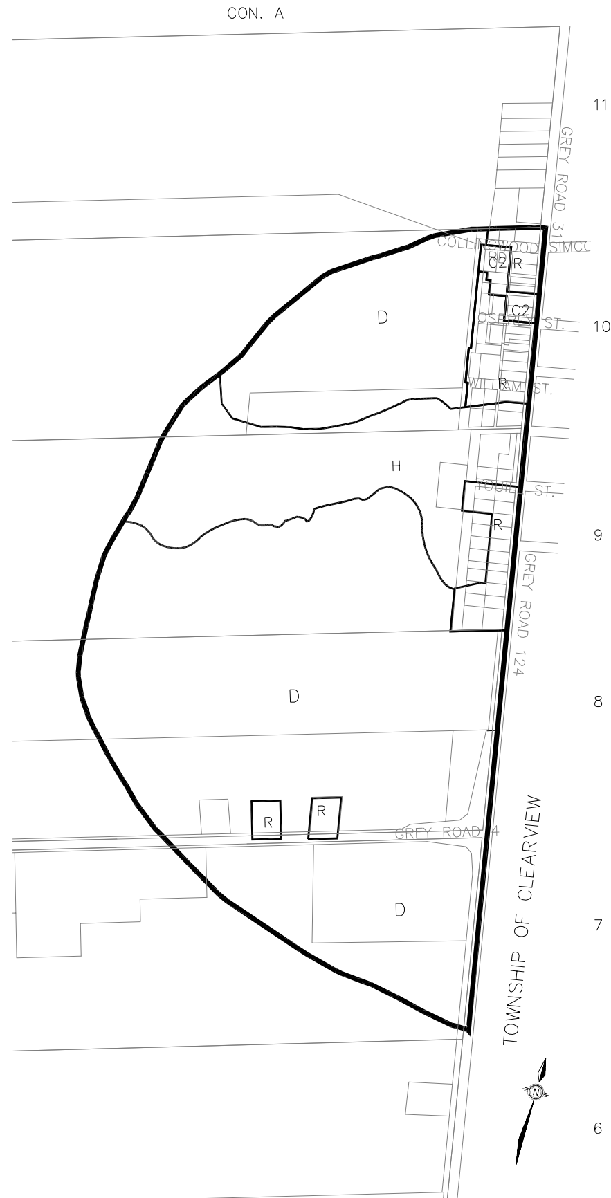
MAP B: HAMLET OF SINGHAMPTON